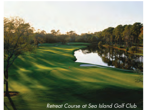
Retreat Course at Sea Island Golf Club