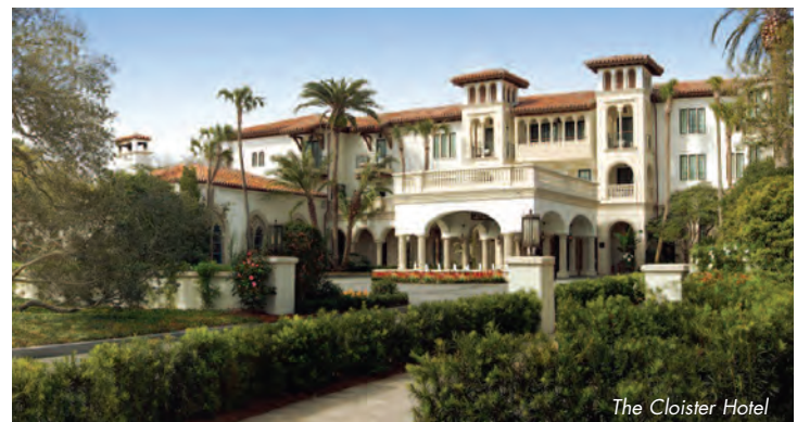
The Cloister Hotel