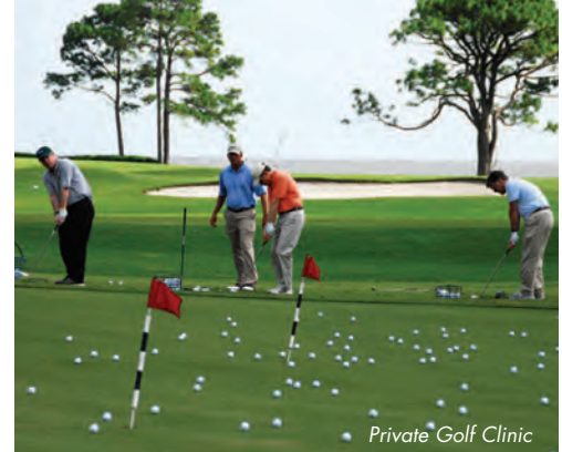
Private Golf Clinic